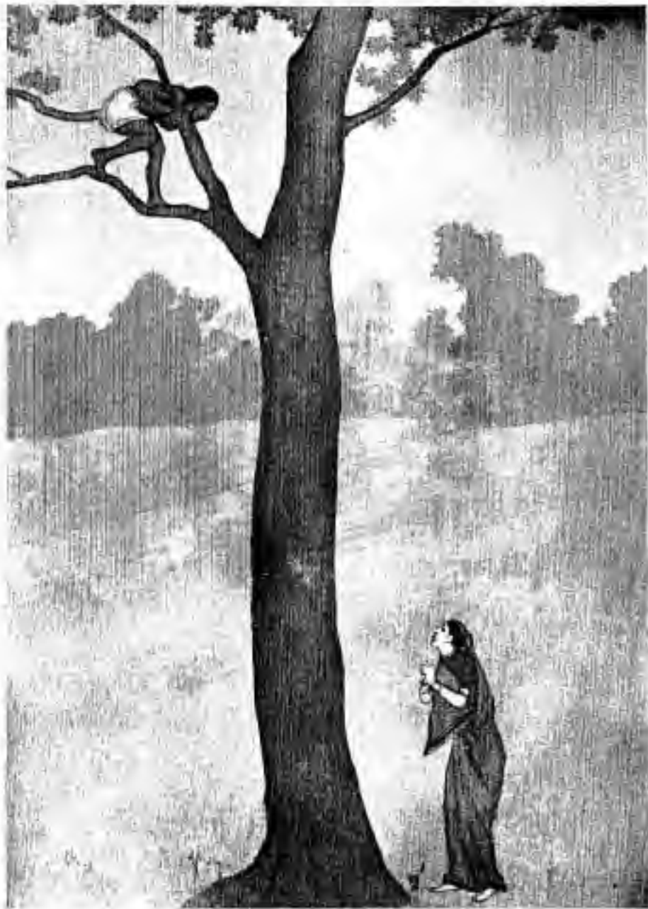
The Rakshas woman came to the tree and saw the goldsmith on its top."